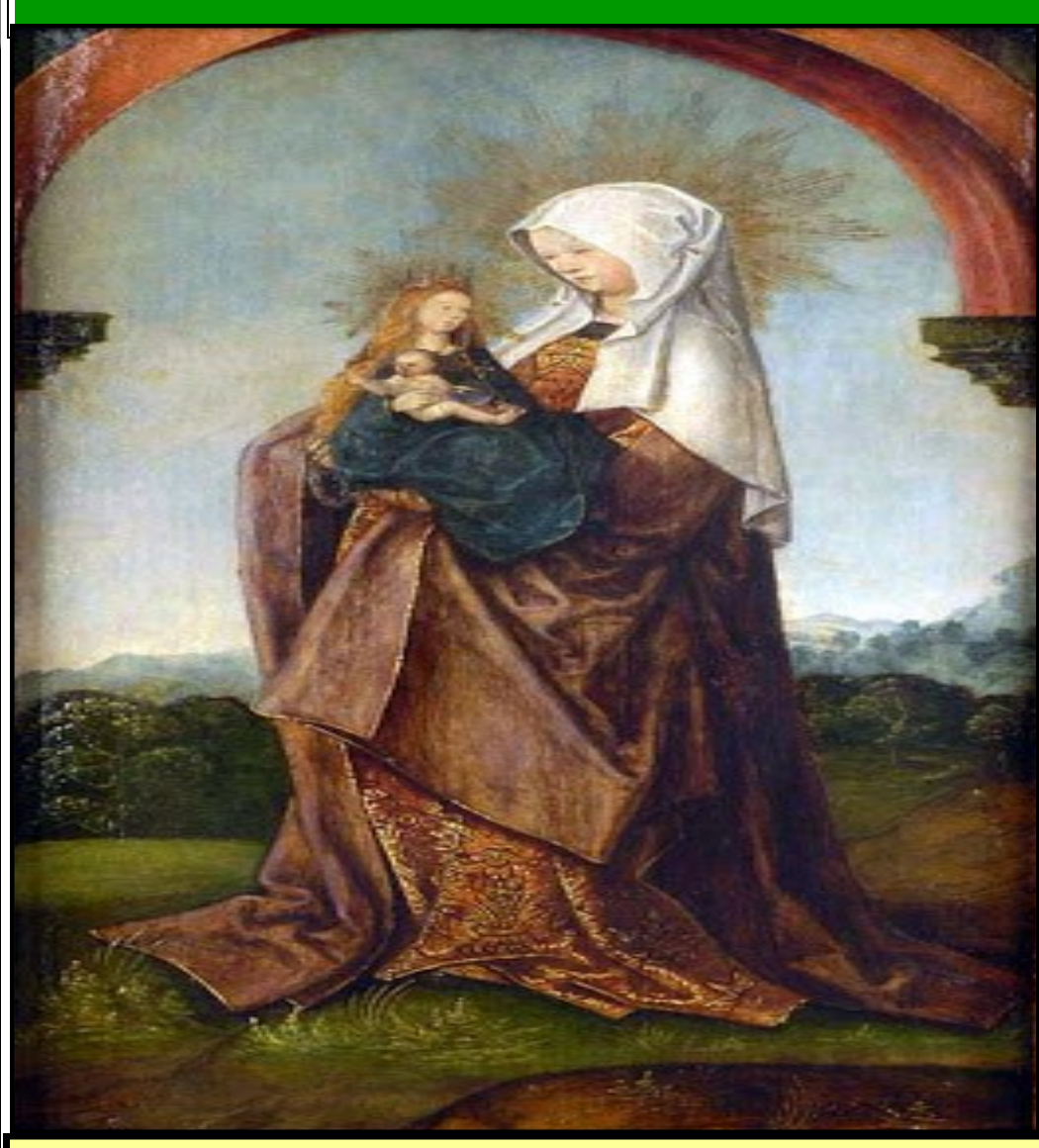
Mt 13:44 Which a person finds and hides again, and out of joy goes and sells all that he has and buys that field.